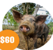
A pig for a family farm