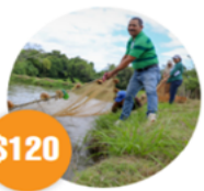
Construction of a fish pond