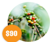
Coffee beans for a resilient crop